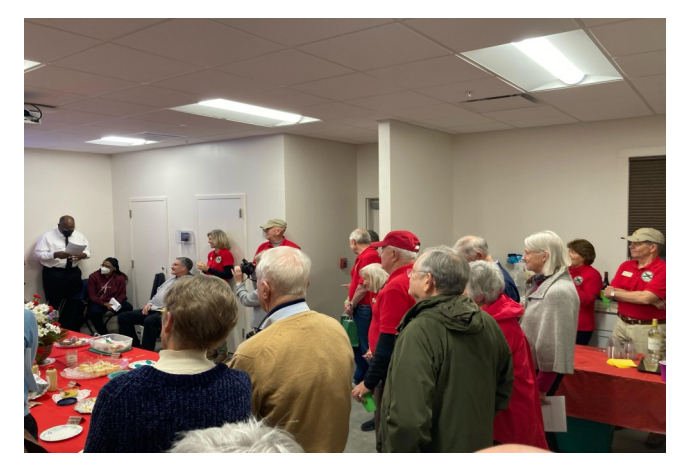
At the Annual Meeting of the Friends of Fort Fremont, members listen to remarks at the unveiling of the new Interpretive Panels