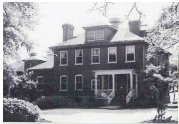
Hospital/Home, East Entrance c. 1989

The Hospital was turned over to the Fort on Oct. 10, 1904. The Hospital is composed of two sections: a square two-story section with a hipped roof and a one-story rectangular wing. The Hospital utilized a unique cooling system. Air intake boxes under the windows connect to a ductwork system and opens at floor level inside the rooms, under metal radiators. Large ducts extend throughout the house and vent out through the large metal ventilators that project from the roof. The hospital was heated by Hot Water radiators. The hospital and batteries are the only surviving buildings of the original Fort.