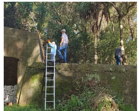
Clean-up Crew at work